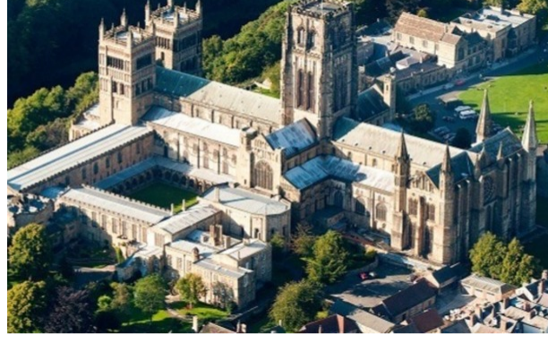
Durham University Durham, UK