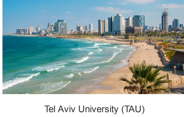
Tel Aviv University (TAU) Tel Aviv, Israel

Save the Date! Study Abroad Week is September 20 - 24. Are you eager to learn more about our 50+ semester and 20+ summer program offerings and our exciting new locations for the 2022-2023 academic year? Attend a series of virtual and in-person events throughout the week to learn more about the many study abroad opportunities. Visit the website for a schedule of events and other on-demand access to our information session videos. We are excited to offer four new semester programs in Israel, Ukraine, Belgium, and UK!