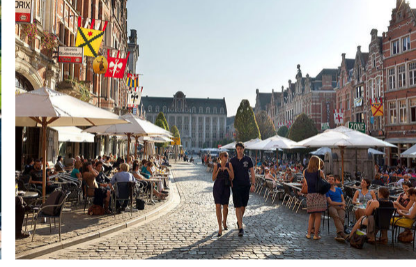
Katholieke Universiteit Leuven (KU Leuven) Leuven, Belgium