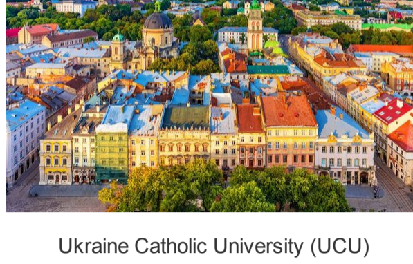
Ukraine Catholic University (UCU) Lviv, Ukraine